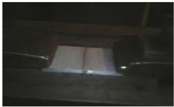
Work pieces before welding